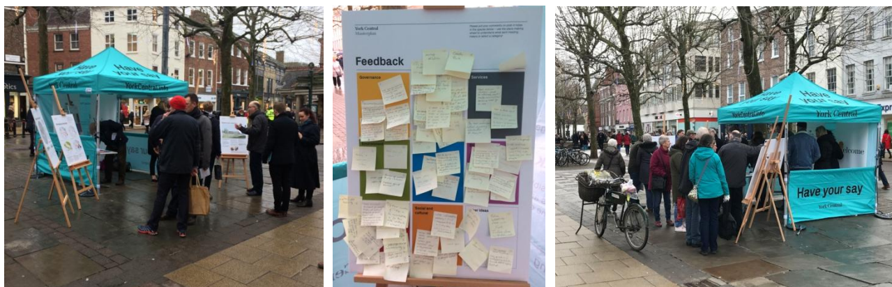
Pop-up event at York Residents Festival January 2018

More detail on each of these principles is given in Annex 1 at the end of this Framework.